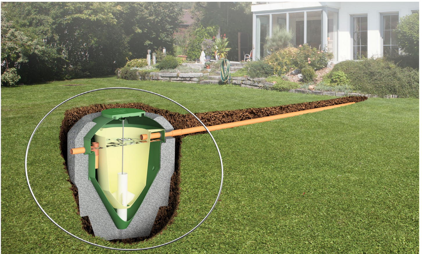
Illustration not to scale

Unlike traditional septic tanks, modern package wastewater (sewage) treatment plants are designed for today's increased volume of water usage in everyday life. Our WPL Diamond has the added advantage of a high quality process for wastewater treatment, in a compact, single tank which is easy to install and maintain.